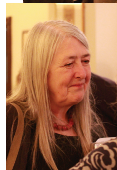
Prof. Mary Beard